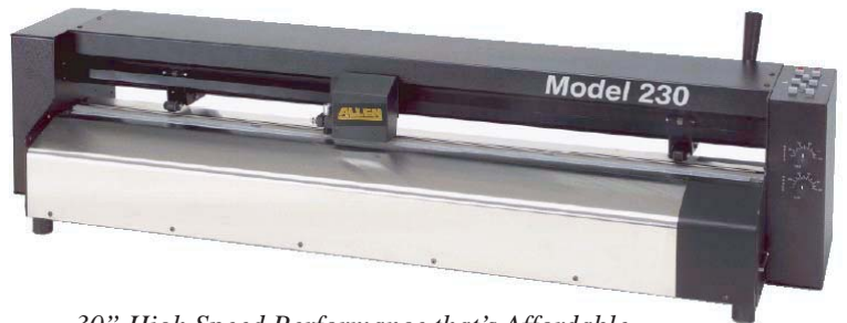
30" High Speed Performance that's Affordable

The 230 is a countertop, 30" high performance, friction feed, vinyl cutting system. It is loaded with performance features seldom found in more costly systems. Material loading and alignment is a breeze. Its intuitive and simple user interface is a user's dream. Process speed and cut force are simply dialed in...even on-the-fly! The 230 has the renowned Gold Touch™ cutting head . That means you have 550 grams of adjustable cut force at your fingertips. It means you can process the full gamut of graphic materials...vinyl, reflective, stencil, heat transfer, paper and more!